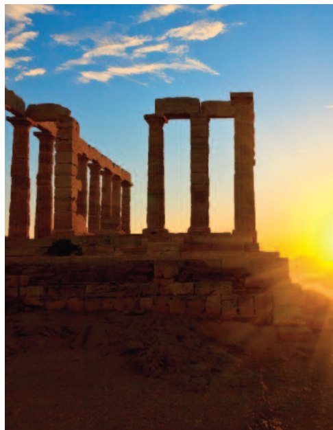
Temple of Poseidon, Sounion