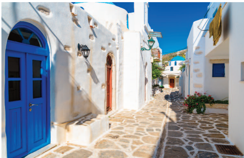
Typical narrow street in old town of Parikia, Paros

Today, we will explore Paros, starting in Parikia, the island's atmospheric main town, where we visit the church of Ekatontapyliani ("One-Hundred Gated"), the most important