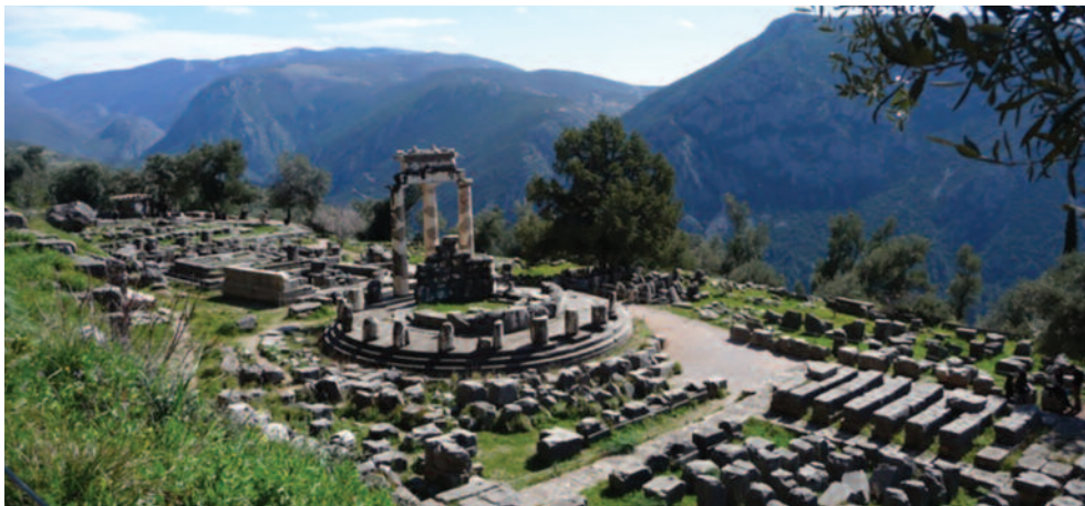
Sanctuary of Athena, Delphi