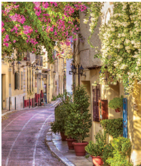
Athens' picturesque district