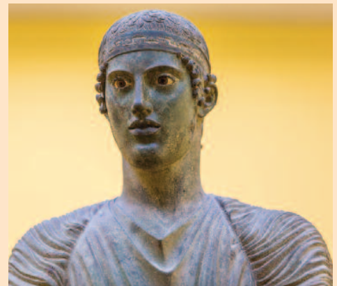
Detail of the bronze statue of the Charioteer. 475 BC. Delphi Museum